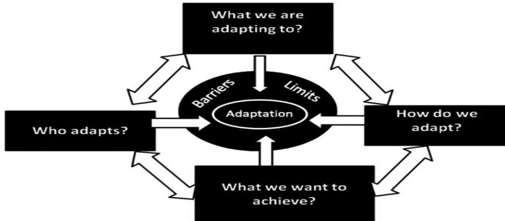
Figure 2: Different dimensions of adaptation

education and sex status of head of household is insignificant to adoption to climate change (Shongwe et al., 2014). Charles and Rashid (2007) identified that assessment to credit and extension and climate change awareness are some of the important determining factor for adaptation at farm level in South Africa, Zambia and Zimbabwe.