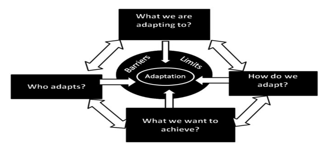
Figure 2: Different dimensions of adaptation

education and sex status of head of household is insignificant to adoption to climate change (Shongwe et al., 2014). Charles and Rashid (2007) identified that assessment to credit and extension and climate change awareness are some of the important determining factor for adaptation at farm level in South Africa, Zambia and Zimbabwe.