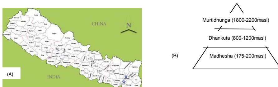
Figure 1. Map of Nepal showing studied districts depicted with star signs (A), and altitudinal locations of the study area (B).

For the present study, three locations of eastern Nepal belonging to two districts (Figure 1A) of eastern region were selected because these places were known to possess relatively higher density of buffaloes. The study locations were differentiated into three agro ecological zones to know the variation of prevalence representing - high hill, mid hill and lowland or plain (tarai). The highest altitude from where samples were collected located at the range of about 1800-2200 meter above sea level (masl) in Murtidhunga (high hill, 27° 09' 64.87" N; 87° 36' 37.94" E); 800-1200 masl in Dhankuta (mid hill, 26° 97' 09.96" N; 87° 34' 31.09" E) of Dhankuta District and 175-200 masl in Madhesha (low land, 26° 63' 43.79" N; 87° 18' 60.72" E) of Sunsari District. Farmers raised buffaloes as semi-intensive type of management. Majority of farmers offered straw and grasses as feed. Only limited farmers provided commercial feed along with local feed materials to buffaloes.