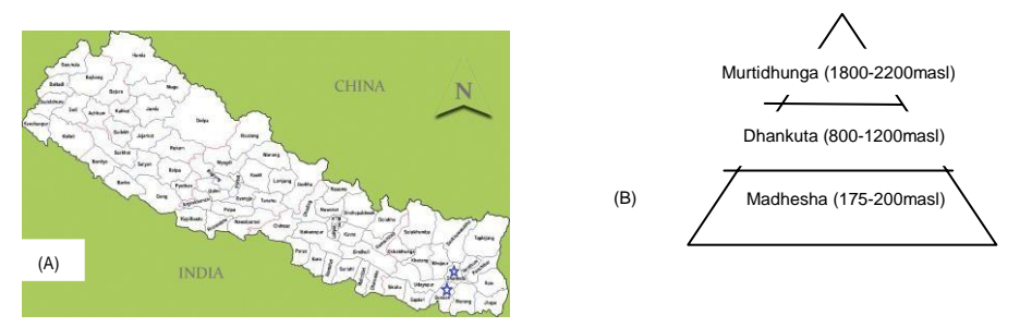
Figure 1. Map of Nepal showing studied districts depicted with star signs (A), and altitudinal locations of the study area (B).

For the present study, three locations of eastern Nepal belonging to two districts ( Figure 1A) of eastern region were selected because these places were known to possess relatively higher density of buffaloes. The study locations were differentiated into three agro ecological zones to know the variation of prevalence representing high hill, mid hill and lowland or plain (tarai). The highest altitude from where samples were collected located at the range of about 1800-2200 meter above sea level (masl) in Murtidhunga (high hill, 27^0 09' 64.87" N; 87^0 36' 37.94" E); 800-1200 masl in Dhankuta (mid hill, 26^0 97' 09.96" N; 87^0 34' 31.09" E) of Dhankuta District and 175-200 masl in Madhesha (low land, 26^0 63' 43.79" N; 87^0 18' 60.72" E) of Sunsari District. Farmers raised buffaloes as semi-intensive type of management. Majority of farmers offered straw and grasses as feed. Only limited farmers provided commercial feed along with local feed materials to buffaloes.