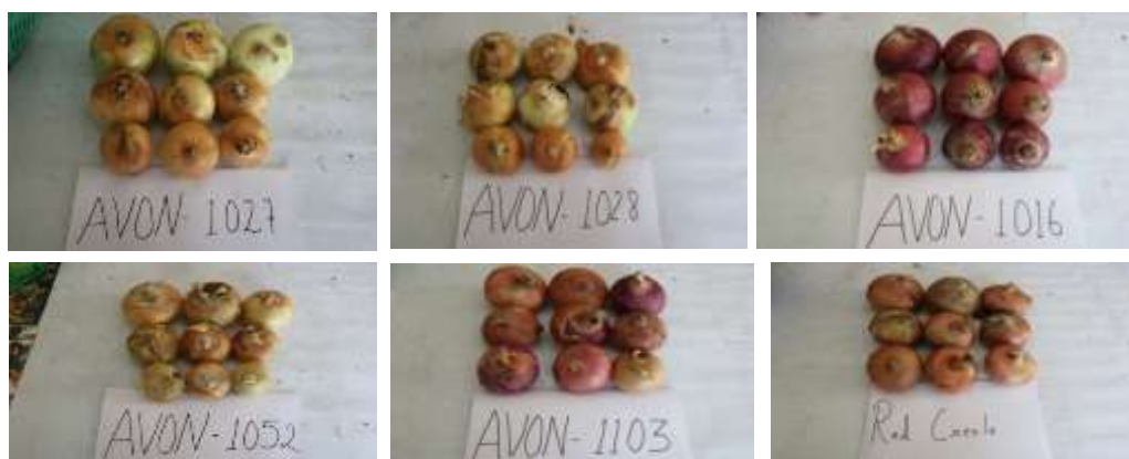
Figure 3. Bulb morphology of onion genotypes tested at HRS, Dailekh, 2017/18.