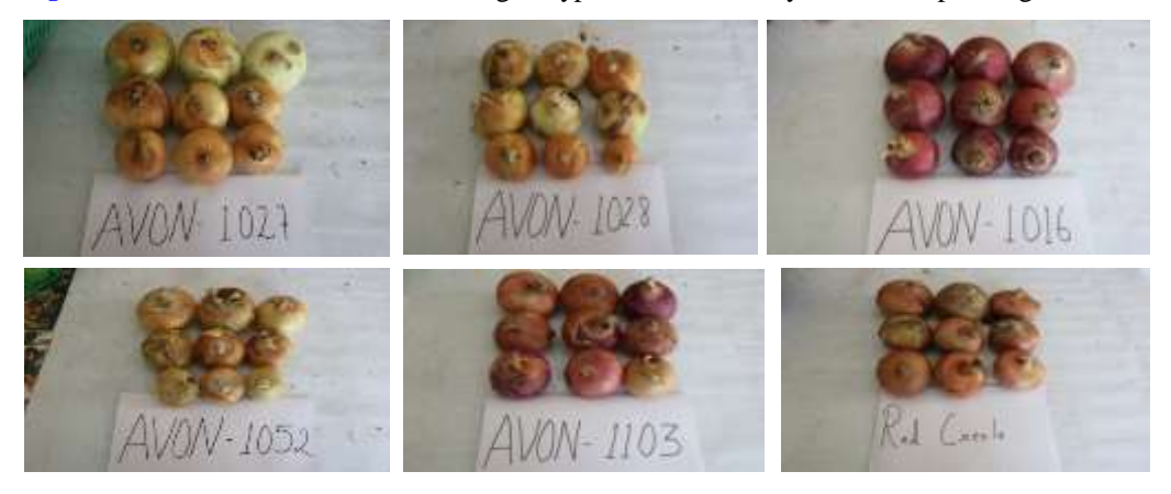
Figure 3. Bulb morphology of onion genotypes tested at HRS, Dailekh, 2017/18.