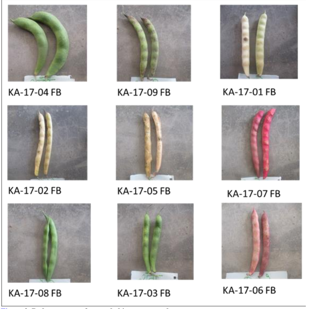
Figure 2. Pod curvature of expanded immature pod.