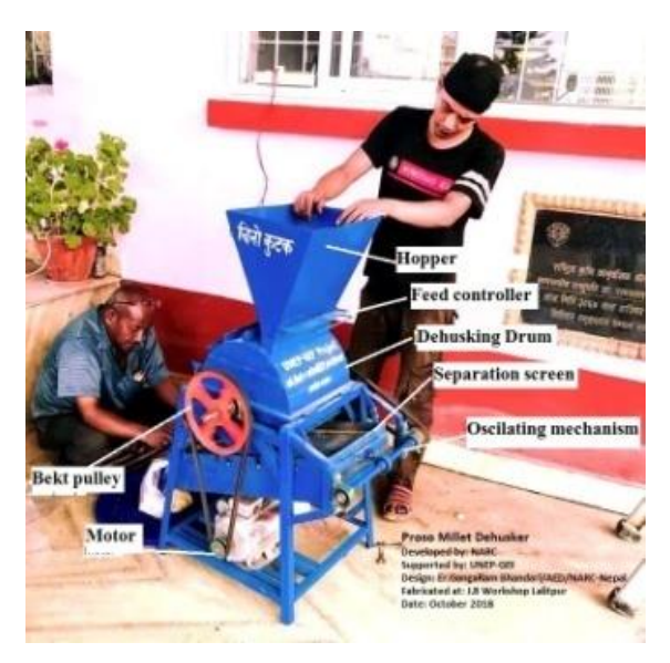
Figure1. Proso millet De-husker Model-1