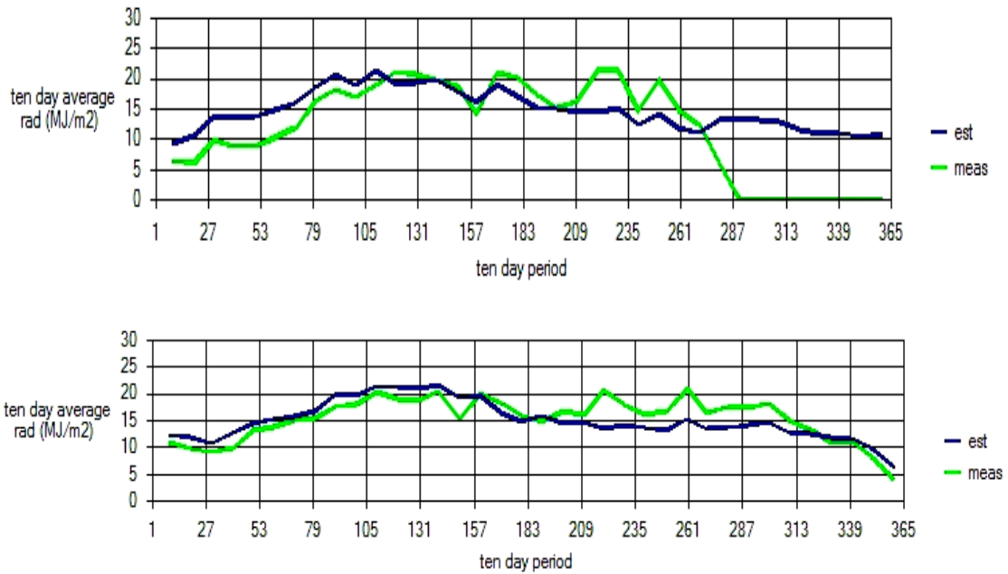
Figures 5 (top) and Figure 6 (bottom): The comparative study of ten days average value of estimated and measured radiation with ten day period in 2006 (top) and in 2008 (bottom).

Figures 3 and 4 show that there is 0.36 and 0.39 coefficient of determination is found in 2006 and 2008. These values are the maximum in DCBB model in comparison with other three BC, CD and DB models.