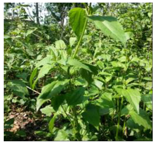
Figure 1: Chromolaena odorata plant photograph

The essential oil from the collected leaf sample was extracted by using Clevenger apparatus (300 ml) for about 3 hours at 80°C by the process of hydro-distillation at Central Department of Botany, Tribhuvan University, Kirtipur, Kathmandu, Nepal.