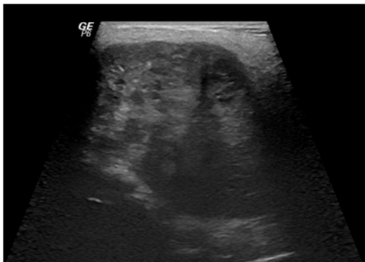
Figure 2: Ultrasound scan of the right parotid gland on a 36 year old female, shows a heterogeneous lesion with few cystic spaces which was considered pleomorphic adenoma but proved mucoepidermoid carcinoma on pathology.