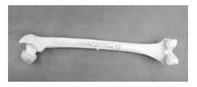
Figure 5: Measuring the caliber of nutrient foramen

Hypodermic needles of gauge 18 to gauge 24 were used to measure the caliber of the foramen. If the needle of 18G size passed through the nutrient foramen satisfactorily, it was classified as 'large' sized. If the needle of 24G size passed through the foramen, it was classified as 'small' size. If the needle of the 20G to 22G size passes through the nutrient foramen it was classified as 'medium' sized. Both large and medium-sized foramen was also categorized as being 'dominant'. If the needle of 24G size could pass or could not pass through the foramen it was classified as 'small' sized or 'accessory' nutrient foramen.