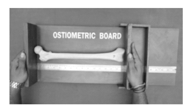
Figure 2: Measuring the length of femur

The total length of each femur was measured with the help of osteometric board (Figure 2) and total length was recorded in centimeters. Determination of the total length of the individual bones was done by taking the measurement between the superior aspect of the head of the femur and the most distal aspect of the medial condyle. After measuring all the bones the 'range of total length' and the 'mean of total length' for femur was obtained.