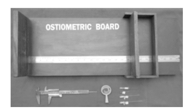
Figure 1: Instruments used in the study

Each femur was numbered serially with numbering sticker to help in identification. Their side (left or right) was determined. The diaphyseal nutrient foramina were observed in all the bones with a hand-lens. Various parameters were recorded for each of the femur. Total length and distance of nutrient foramen from upper end were measured in centimeters. Locations of nutrient foramen and number of foramen were also noted in relations to surfaces. The sizes of nutrient foramen were measured with the help of hypodermic needles of 18G to 24G.