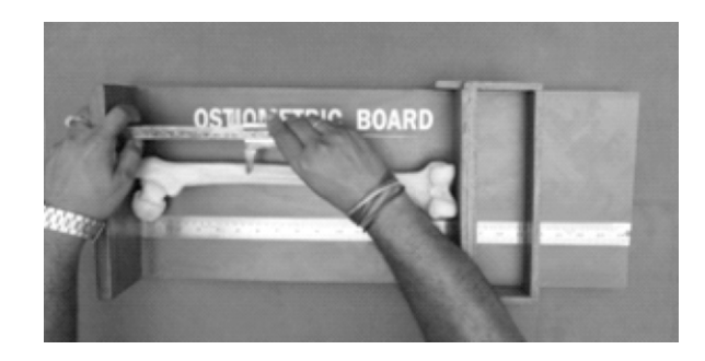
Figure 4: Measuring the distance of nutrient foramen from upper end

The distance of the nutrient foramen from the upper end of the bone was measured with the help of sliding vernier caliper and recorded. The range and the mean distance of nutrient foramen from upper end was calculated and recorded (Figure 4).