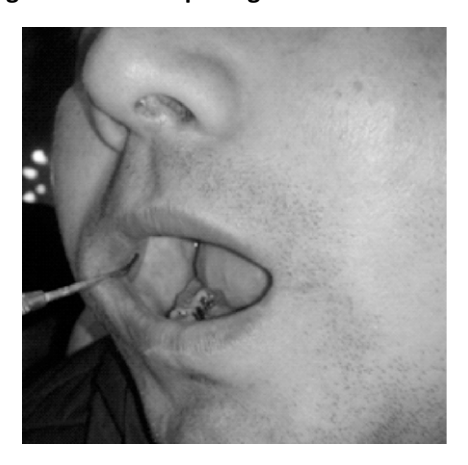
Figure 2: Palpable fibrous band in buccal mucosa