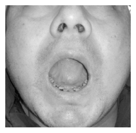
Figure 3: Mouth opening after treatment of 12 weeks

(4mg/ml) plus Hyaluronidase 1500 IU in each buccal mucosa for a period of 12 weeks. During every clinical evaluation the mouth opening was measured and burning sensation associated with the lesions were graded on VAS.