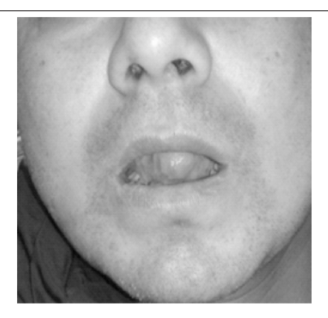
Figure 1: Mouth opening before treatment