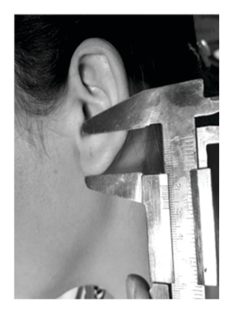
Figure: 4: Measuring the height of lobule

The auricle height was measured in mm as distance from highest point on Helix (A) to the lowest point on lobule at (B). Auricle width was measured as the distance from (C), the most anterior and (D) most posterior point of the auricle. Lobular height was measured as a distance from point (E) on intertragic notch to lower point on lobule (B). Lobular width was measured as distance from point (F) to (G).