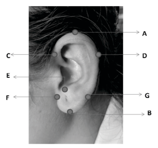
Figure: 2: Various points on auricle