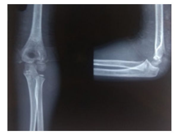
Figure 1 : X-ray AP and lateral view of elbow after injury

The treatment of displaced lateral condyle fracture of humerus by open reduction and K-wire fixation is safe and cost effective with excellent results. The removals of unburied K-wires are easy and can be done in outpatient basis which removes the need for second surgery. This modality of treatment decreases the duration of total hospital stay in pediatric school going children by removing the need of second surgery during implant removal, however a randomized controlled trial with larger sample size would increase the significance of this study.