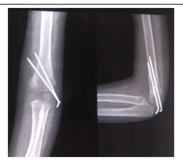
Figure 3 : X-ray AP and lateral view elbow on follow up