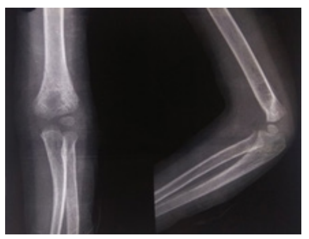
Figure 4 : X-ray AP and lateral view elbow after implant removal during follow up.