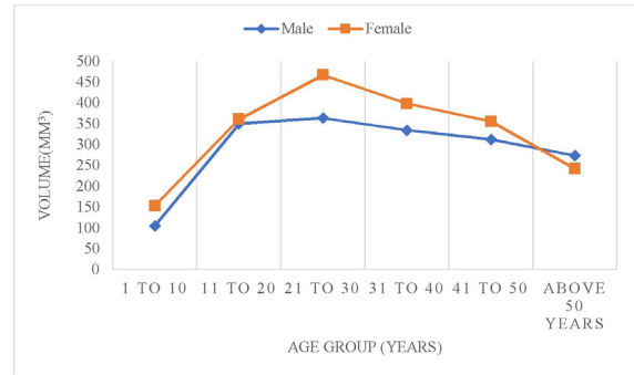
Figure 3 : Relationship between age and pituitary gland volume

Superior surface of the gland was categorized as concave surface, flat surface and convex surface. Superior flat surface was observed in 50 patients whereas the surface was concave in 44 and convex in 40 patients. Concave surface was mostly observed in patients <10 years of age and >50 years of age, while young adults showed mostly flat and convex surface. Pituitary volume was largest in age group 21 to 30 for both males and females. The lowest values recorded were in age group <10 years followed by above 50 years of age. Pituitary height and volume correlated negatively for age (p=0.161).