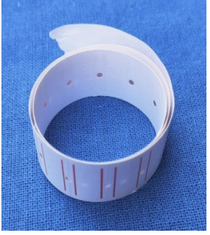
Figure 2: Instruments used in the present study