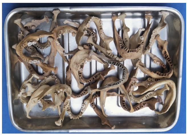
Figure 3: Showing the bones used in the present study

Each mandible was numbered serially with numbering sticker to help in identification. The positions of the mandibular foramen from various landmarks were recorded on both the sides of ramus, with the help of vernier caliper of 0.1 mm accuracy.