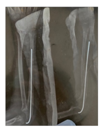
Figure 2: Immediate post-operative X-ray with intramedullary K-wire fixation of ulna