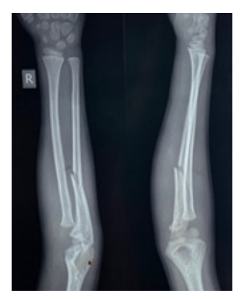
Figure 1: Bado's type I Monteggia fracture dislocation.

Trans capitellar pins were removed on third weeks in all five cases. In all cases range of motion was advised after removal of slab.