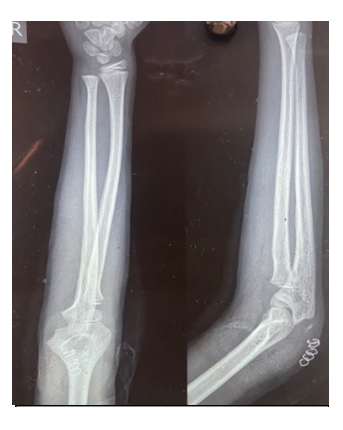
Figure 4: X-ray after removal of implant

Figure 1: Series of pictures showing monteggia fracture