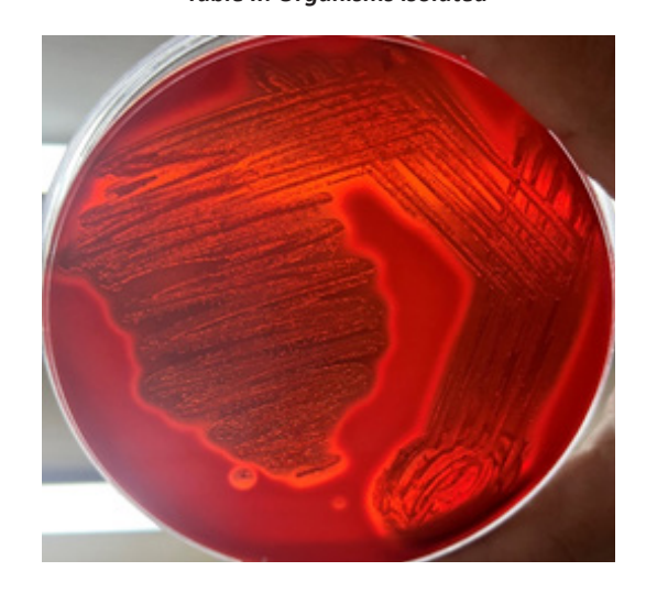
Figure 2: Growth of GABHS in blood agar media

When the McIssac score was correlated with presence of GABHS infection it was found that with increasing score the possibility of GABHS infection in acute tonsillitis increased significantly, with 25% chance in patients who had score 2 and 37.5% in score 3. (Table III) The pattern of sensitivity to different antibiotics in relation to the isolated organism is shown in table IV.