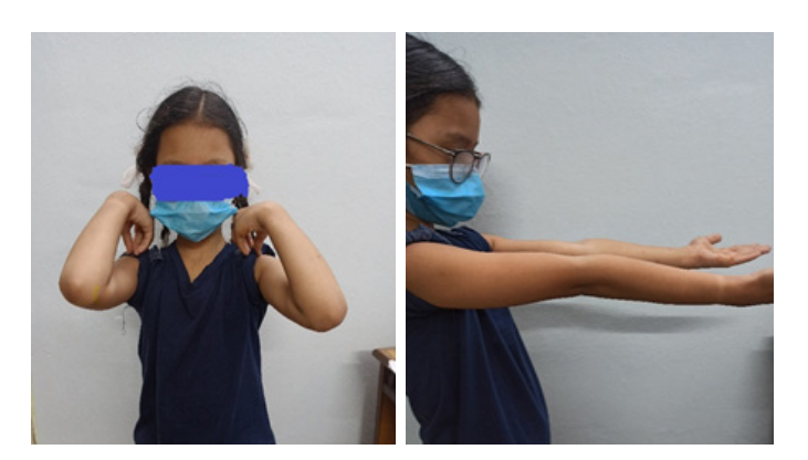
Figure 4: Elbow ROM