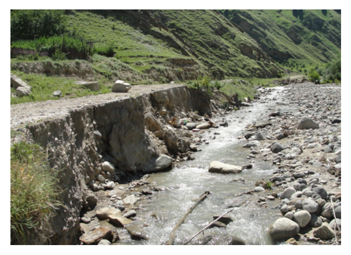
Fig. 10: Lateral erosion of the right bank of the Gestanty River as a result of a water rock flow on May, 21, 2014; a road to the potable water intake for the settlement of Bylym was destroyed.