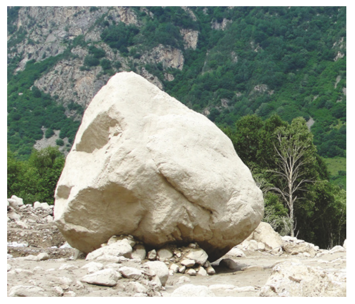
Fig. 7: A debris flow on the Gyulchi-Suu River (a right tributary of the Terek Balkarsky River) on July 16, 2011 carried granite blocks of up to 60 t.

In July 2011 on the Gyulchi-Suu River, a right tributary of the Cherek Balkarsky River, over the mouth reach of which a diversion canal of the Verhnebalkarskaya Malaya hydroelectric power station is to be built, a powerful high-density debris flow occurred, carrying huge hard rock blocks and completely destroying a highway running through the master valley (Fig. 7).