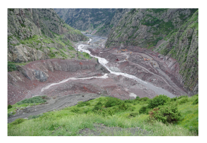
Fig. 13: The Terek River with the Daryal hydro-electric power station under construction in the distant view on June 10, 2014. Breaching of the debris rock-ice flow deposits of the Kabahi River.

The blockages of the Terek River by large debris flows on the left-bank tributaries, nourished by Kazbek glaciers on the