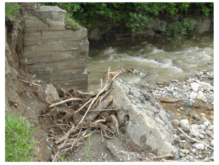
Fig. 9: Washout of the upstream slope and destruction of a part of a reinforced concrete structure of the entry portal of the tunnel on the Gizhgit River as a result of a debris flow of May 21, 2014.

On 21 May 2014 water-rock flows also went down the Gestanty river channel while mud-rock flows - down the rest