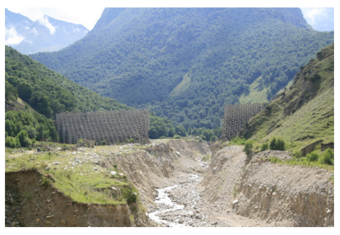
Fig. 2: A structure built for protection of the town of Tyrnyauz on the Gerkhozhan-Suu River was destroyed by a debris flow in 1999.

- all significant debris flow events of 1960 and the following years (including 2000) have been of glacial genesis and initiated in the upper reaches of the left tributary of