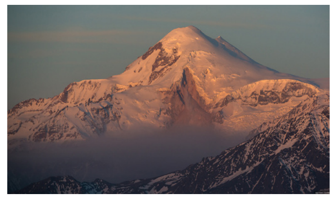
Fig. 12: View of the part of the eastern slope of Kazbek Mountain immediately after the catastrophic event (18 May).

Having entered the Terek valley, the flow ran into the right-bank of the gorge, turned left, forming a blockage 1-1.5