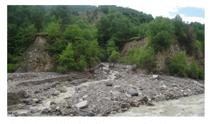
Fig. 11: A debris flow fan of the Abardan-Suu River blocked the Chegem River on May, 21, 2014 and destroyed a gas pipeline and a section of the Nizhny Chegem-El Tyube highway.

Unlike the debris flows that reached the mouth parts on the rivers of Abardan and Bykmylgy-Suu (as well as the rivers