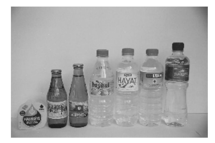
Fig. 1: The bottled waters in Turkey