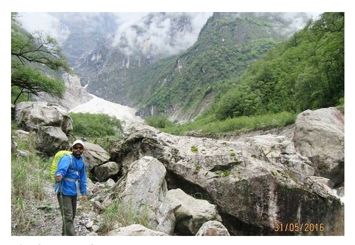
Fig. 2: Dam of Kahphuche Lake.

In this glacial lake, meltwater is trapped between the glacier terminus and the end moraine. The lake seems to be formed by accumulation along the glacier margins, between the lateral moraine and the side of the valley. Depending on the topography of the end moraine, small lakes seem to form because of water accumulation in the numerous depressions that are characteristic of the terrain. The steep slope of Annapurna II (7,937 m), at about a 70 degree angle and height of 5,502 m from the lake, is the main geographical element responsible for the formation of the glacial lake. Avalanches, rock falls and huge icebergs separating also contribute to the formation of this glacial lake at a low elevation.