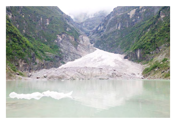
Fig. 1: Kahphuche (Gopche) Glacial Lake