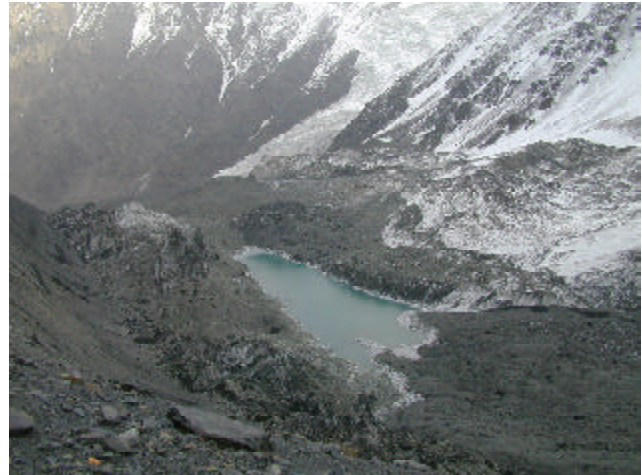
Fig. 8: 20.10.2002. New lake formation in the mountain valley previously covered by the Kolka Glacier (till 20 Sept 2002).