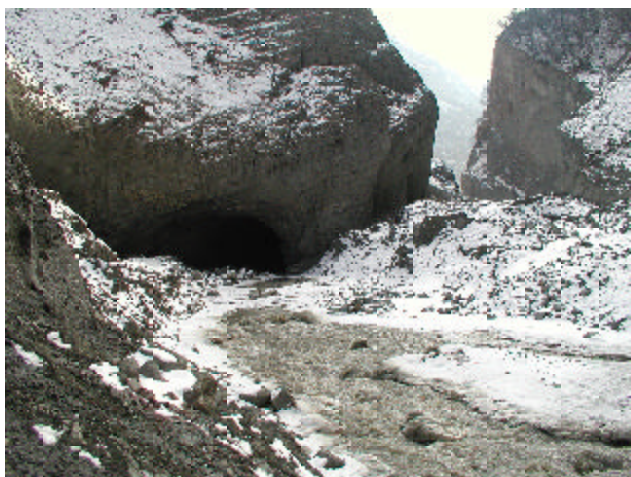
Fig. 11: The Genaldon River is flowing through the south end of highway tunnel remnant. (Photo by E. Zaporozhchenko, 20 Feb 2003).

appeared in the frontal part of the Huascaran avalanche.... The speed of that flow reached 36 km/h..." (Hromovskih 1984).