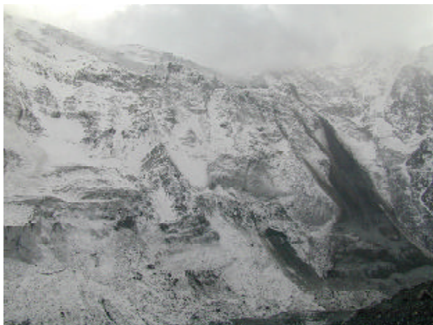
Fig. 3: The ice masses on the northern slope of the Maili-Dzhimaraj-Hokh mountain range. Note dark background on the right, in the outlined border of the ice avalanche of 20 Sept 2002. (Photo by O. Ryzhanov, 20 Oct 2002).

Probably, people were lulled by the published (in Zalihanov et al. 1991 and Rototaev et al. 1983) provisional prognosis of the surging glacier's 70-year cycle. Thus, according to Zalihanov et al. (1999, p. 210), "the Kolka Glacier is getting ready for another "rebellion", similar to the previous one in 60–70 years, i.e. approximately in 2040". An earlier date, which one can find in Panov et al. (2002), was 2010–2015. These figures had been probably ignored – the lessons of the past were completely forgotten at the beginning of the 21 st century.