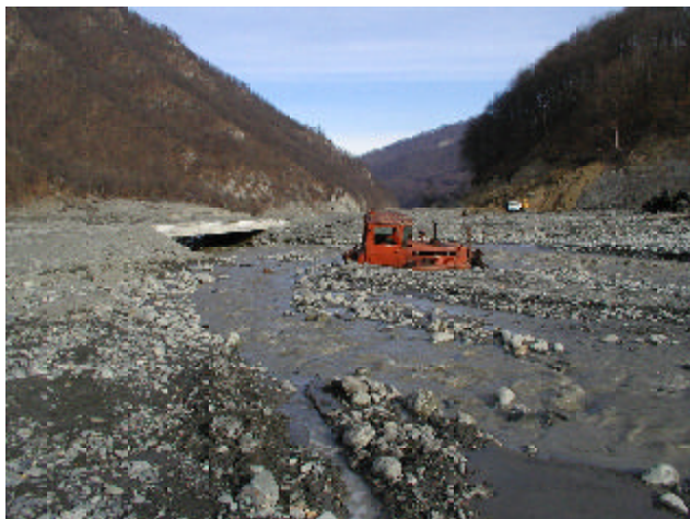
Fig. 9: Debris flow stone-mud masses in the mouth of the Genaldon river. The downstream view. (Photo by E. Zaporozhchynko, 6 Dec 2002).