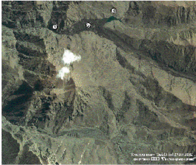
Fig. 6.: Satellite imagery of the Genaldon river valley: 1 – “The Karmadon Gates”; 2 – rock-ice masses of 20 Sept 2002 blockage; 3 - newly formed Lake “Gornaya Saniba”