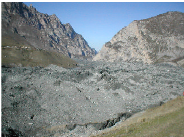
Fig. 4: The rock-ice blocking masses near the “Karmadon Gates” (Photo by E. Zaporozhchenko, 6 Oct 2002)

of the village of Gizel, the debris flow became a sediment-laden flood. It would be more correct to speak not about “ice masses” but “rock-ice masses”, which include about 30% of rock material with clasts of a very wide range of sizes and about 70% of ice itself. This mass moved down a distance of about 19 km from the place of its collapse on the Kolka Glacier down to the narrows of the Skalistyy Range (Fig. 4).