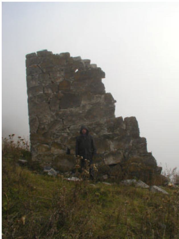
Fig. 1: The ruins of Genal village.

September 2002 in the upper reaches of the Kolka Glacier, in the mountains of North Ossetia, there was again an ice “collapse” the result of which was another catastrophe—on a much greater scale as compared with the one of July 1902, as 19 people were killed and 106 were lost according to the reports of 19 February 2003. This event was not only a major natural catastrophe of the year 2002 for Russia and Europe, but also a major catastrophe of glacial character for the entire world.