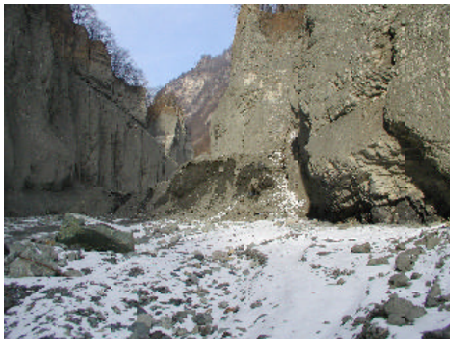
Fig. 10: An ice block on the Genaldon river's right bank (the lower highway tunnel section). The downstream view.