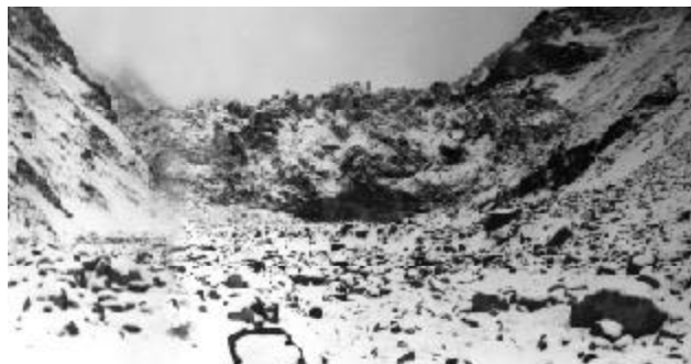
Fig. 2 : The ice front of the moving glacier Kolka is filling the valley of the Genaldon River at an altitude of 1980 m. Verkhne-Karmadonskies mineral springs are blocked on 29 January 1970.

Here, I have presented my own views on this event based not on the numerous but contradictory, confused, and sometimes incorrect media publications, but on the materials of my research and analysis as well the study of aerial photographs obtained from S. S. Chernomorec, I. V. Galushkin, A. P. Polkvoj, and O. A. Goncharenko 3 .