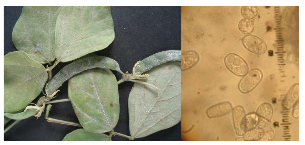
Macrotyloma infected with powdery mildew