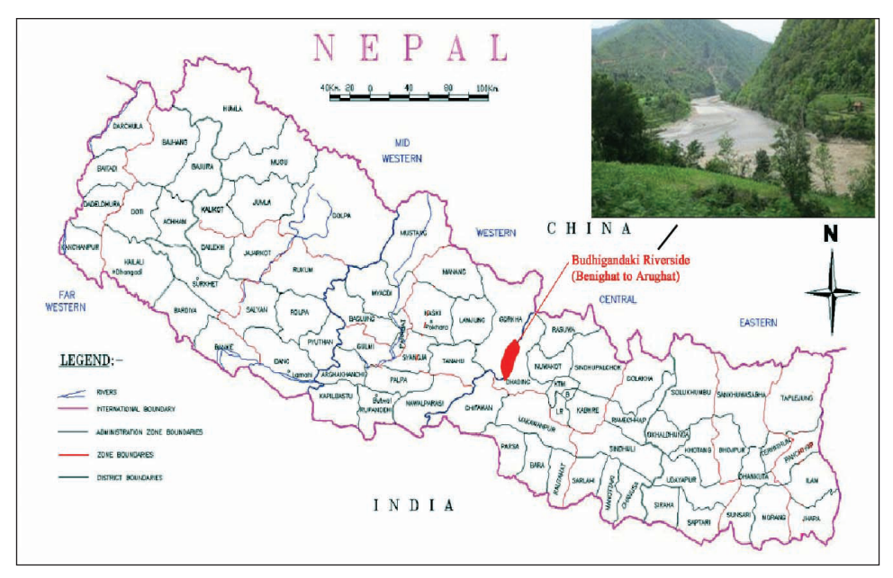
FIG. 1. Location of research site in the map of Nepal.

The study area lies about 3 km north from Benighat bazaar of Prithvi Highway. Benighat bazaar is located at about 85 km west from Kathmandu, the capital of Nepal. The study area is situated between 27° 48' 54.48" N latitude and 84° 46' 33.63" E longitude. The altitude is 401m above the sea level. The area is rich in biodiversity. Mixed type of forest especially tropical deciduous riverine forest, sub-tropical grassland and sub-tropical evergreen forest are the major types of forest along the Budhigandaki river basin (fig. 1).