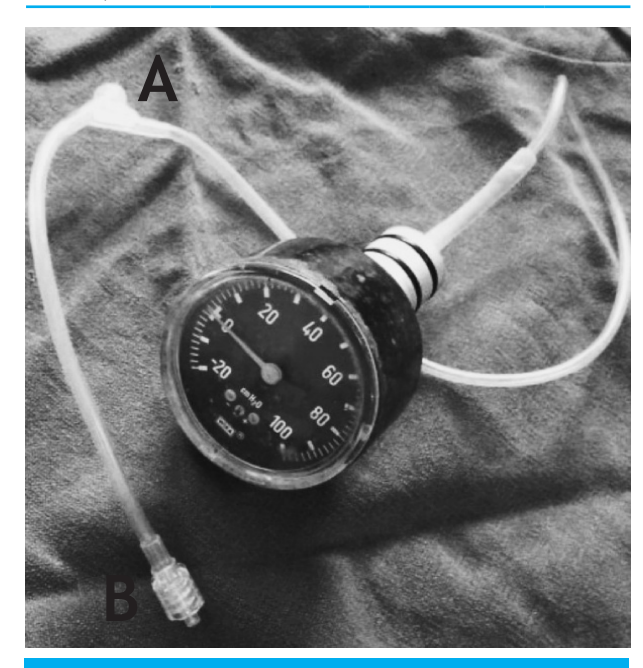
Figure 1. Aneroid Manometer used to measure endotracheal tube cuff pressure. A: air injection port, B: port attaching to pilot balloon of endotracheal tube