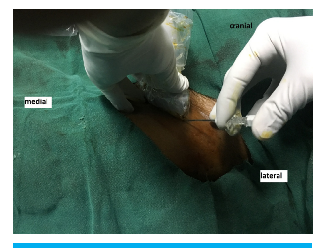
Figure 1. USG probe placed transversely on upper thigh below inguinal ligament and touhy needle used for fascia iliaca block.

paracetamol 325mg. The NRS further decreased with addition of above drug. The infusion was continued for 72 hours without any complication and patient was sent to ward after 72 hours with Tab ultracet.