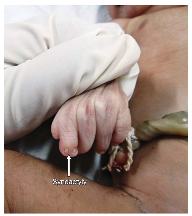
Fig 3: Showing Syndactyly of the Right Hand