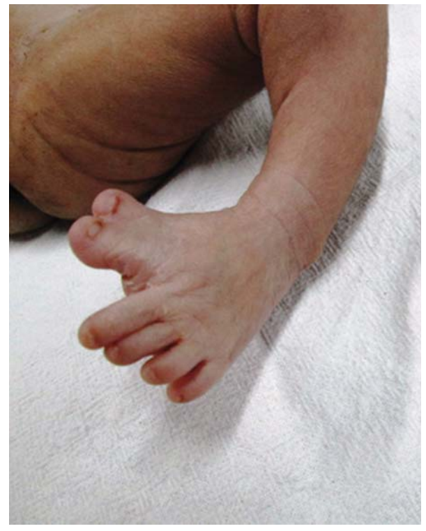
Fig 2: Showing Polydactyly and Syndactyly of Great Toe of Left Foot