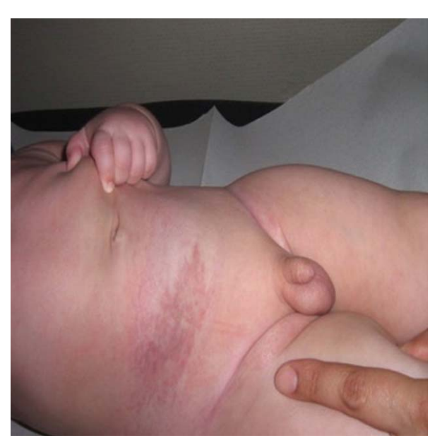
Fig 4: Minimal lesion after nearly 8 months of treatment.