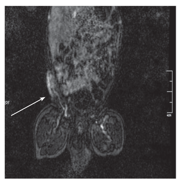
Fig 1: a-b: MRA:Giant vascular structure. Fig. 1-b: Feeding vessel was the right common femoral artery and draining happened via the right common femoral vein (white arrow).