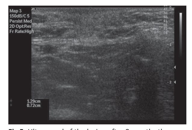
Fig 5: Ultrasound of the lesion after 8 months therapy.