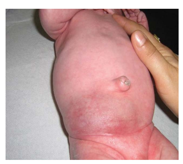
Fig 3: Regression of size after nearly 4 months treatment.