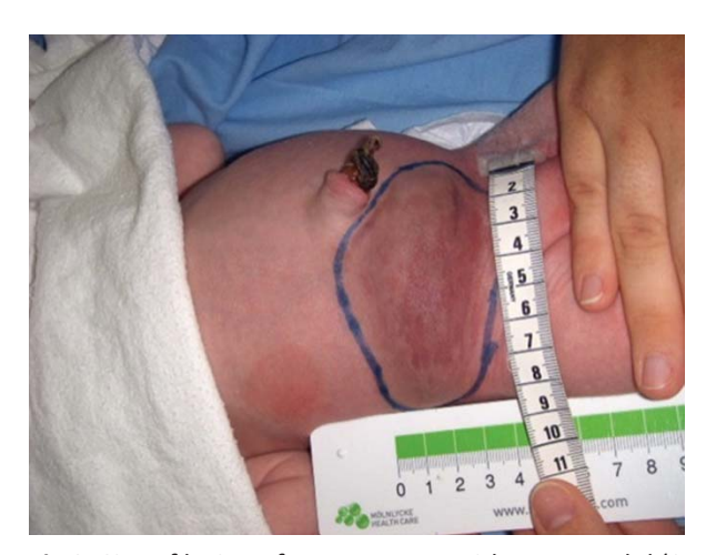
Fig 2: Size of lesion after treatment with Propranolol (2 mg/kg/day) orally.