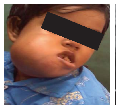
Fig 1: Patient at the time of presentation.