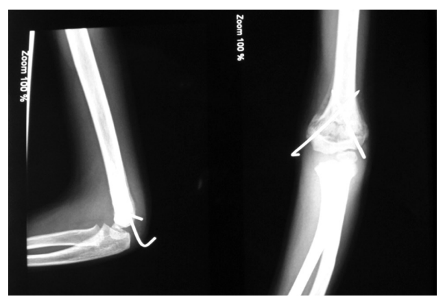
Figure 2. X- ray after 4 weeks after CRPP of fractures humerus in children