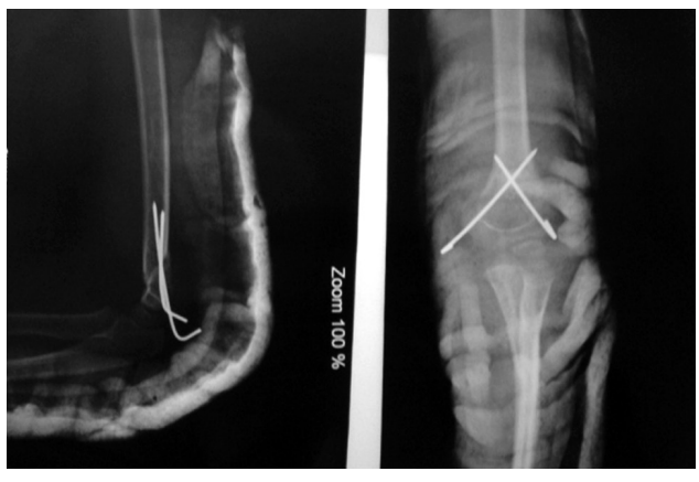
Figure 1. Immediate post operative x-ray after CRPP of fractures humerus in children