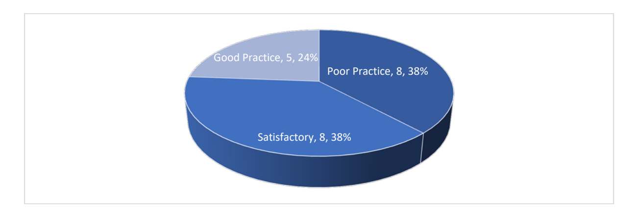
Figure 2. Level of practice among nurses regarding breastfeeding of BFHI, N=21