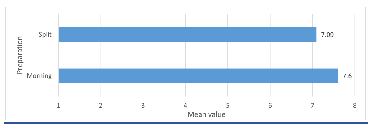
Figure 3. Comparison of Morning-only and Split-dose using Boston Bowel Preparation scale