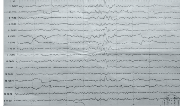
Figure 2: Waking state EEG showing spikes/epileptiform discharges on left frontotemporal region.