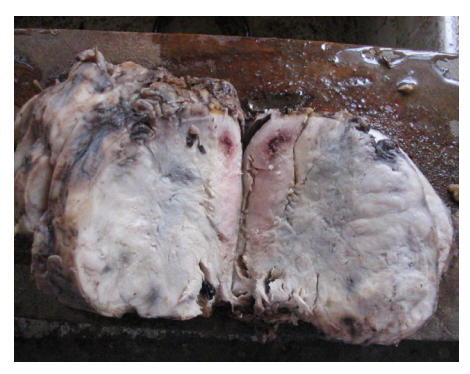
Figure1: Gross picture showing the tumour about 8×5×4 cm, well- circumscribed, nodular mass

nucleus and increased mitotic count. The sarcomatous stroma showed as malignant fibrous histiocytoma like elements, also had osteoid formation and chondromyxoid substance at places (fig.2). Immunohistochemistry demonstrated Vimentin and Cytokeratin positivity (fig.2 & 3). It was diagnosed to be a case of metaplastic carcinoma of breast.