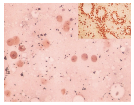
Figure 1: Photomicrograph showing FNAC and biopsy slide (inset) of fibroadenoma. Note the AgNOR dot with symmetrical and regular contour. (AgNOR stain, X100).

carcinoma and 1 case was of medullary carcinoma. In all 18 cases 100 % correlation was observed in both histological and FNAC. Amongst the 19 histopathological graded cases, grade 1 was the highest (n= 11), followed by grade 2 (n= 7) grade 3 (n=1).