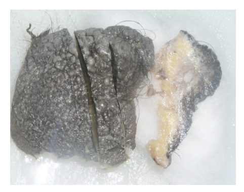
Figure 1: Gross appearance, Animal-type melanoma. The lesion is heavily pigmented.

of Carney complex (myxomas, spotty skin pigmentation, endocrine overactivity, and schwannomas). Regional lymphadenopathy was not present.