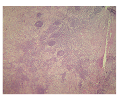
Figure 1: Low power view of the lesion, nasal mucosa with histiocytic proliferation underneath; Extensive histiocytic proliferation. And few lymphoid follicles [HE stain, X100]

Histopathologically, it is characterized by flooding of lymphatic sinuses by histiocytes and plasma cells. The most important diagnostic finding is emperipolesis which is active penetration of a smaller cell into or through a larger cell more commonly phagocytosis of intact lymphocytes, plasma cells or red blood cells by histiocytes.<sup>13</sup> In extranodal diseases emperipolesis is seen less frequently but in our case it was quite frequent. Immunohistochemistry like positivity for S100 and CD68(+) and negativity with CD1a protein help differentiate RDD from malignant disorders such as lymphoma.