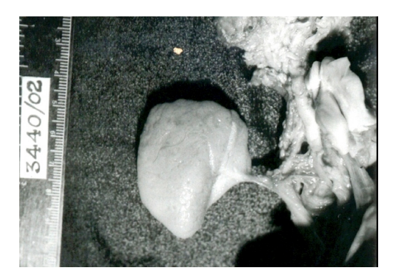
Figure 2: Extralobar sequestration attached with a thin stalk to the mediastinal structures

On examination of the thoracic cavity revealed a hypoplastic right lung, large supra-diaphragmatic extra-pulmonary mass attached by a thin stalk to the mediastinal tissue, mediastinal shift to the left. Cut section of both the lung and extrapulmonary mass was homonogenous, pale white with numerous randomly distributed cysts 0.1 to 0.5cm in diameter.(fig. 1 and 2). The histopathology of the extra pulmonary mass showed a fibrous capsule with underlying