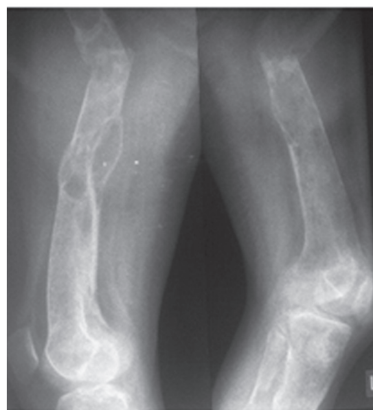
Figure 2: X-Rays of Femur bones (right and left) with knee joint

She was treated with adequate hydration, inj. Zoledronic acid 5 mg, followed by tab Alendronic acid 70 mg once weekly. Skin traction was applied bilaterally for femur fracture. She was planned for excision of the parathyroid adenoma.