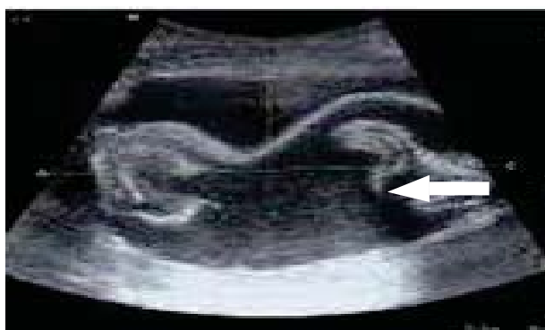
Figure 2. Ultrasonography: Arrow showing fluid collection with floating mesh