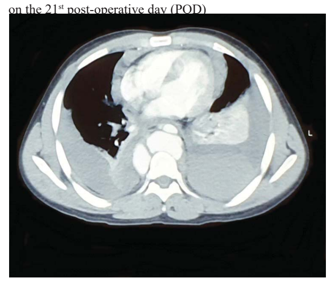
Figure 1. CECT chest showing contrast extravasation from DTA with bilateral hemothorax

levels in blood gas studies despite oxygen supplementation and chest physiotherapy. In view of the patient developing acute lung injury (ALI) and to ascertain graft function, a CECT chest was repeated which revealed diffuse right-sided lung contusion and consolidatory changes with no collection in the thoracic cavity and an intact graft ( Figure 3 ). With the patient showing no clinical improvement in lung function, a bedside bronchoscopy with lavage was done and the fluid was sent for c/s after the first sputum sample yielded no growth. Klebsiella pneumoniae was isolated and appropriate antibiotics as per sensitivity were initiated. The patient gradually started improving and was weaned off of ventilator in nine days and after completion of the course of intravenous antibiotics he was discharged