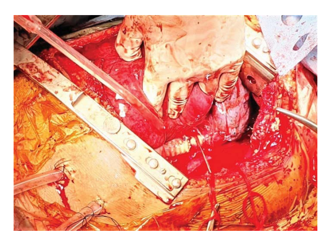
Figure 2. Intraoperative image showing interposed Dacron graft