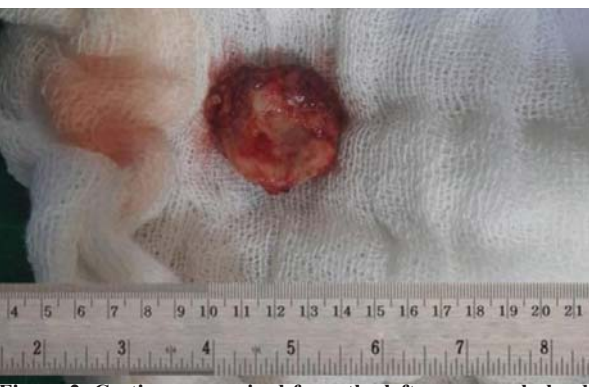
Figure 2. Cystic mass excised from the left suprarenal gland (scale has been added later for the size reference)

The patient received two cycles of Cyclophosphamide. N-MYC amplification test which was negative. A CECT of the abdomen and pelvis done 6 months after surgery revealed enhancing lymph nodes in the left paraaortic region, stenotic left pelvic ureteric junction, and moderate left hydronephrosis. Computed Tomography guided Intravenous urography (CT-IVU) revealed a few left paraaortic nodes with left PUJ stenosis and moderate to gross left hydronephrosis with obstructive uropathy. We