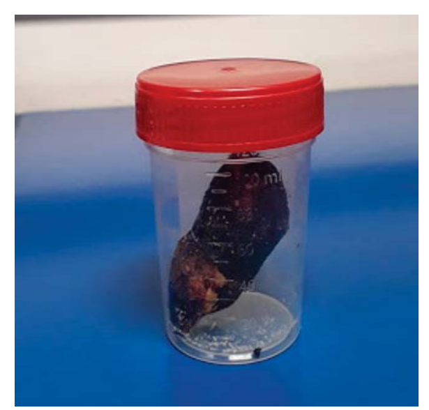
Figure 3. Stone removed by enterolithotomy.

Gallstone ileus mostly occurs in elderly women with associated comorbidities.<sup>2</sup> In the case presented, the patient was a woman with a history of poliomyelitis with reduced mobility and hypertension. The gallstone ileus presentation is often characterized by insidious and intermittent obstructive symptoms, which might delay diagnosis.<sup>2</sup> Our patient reported symptoms with 3 days of evolution, assuming it was a usual biliary colic. Imaging is the main diagnostic tool, allowing the recognition of pathognomonic findings and the exclusion of differential diagnoses, which include all other complications of cholelithiasis. Our patient presented