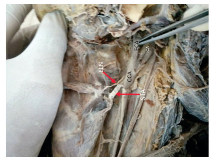
Figure 3 . Showing the origin of STA from left CCA, 15 mm below the CCAB and external laryngeal nerve above the STA at the origin of STA and turning medially away from STA at 0.3 mm above the apex of thyroid lobe

Figure 2 . Showing the origin of STA by common trunk with lingual artery at right CCAB (0 mm from the CCAB) and external laryngeal nerve is posterior at the origin of STA and turning medially away from STA at 0.5 mm above the apex of thyroid lobe