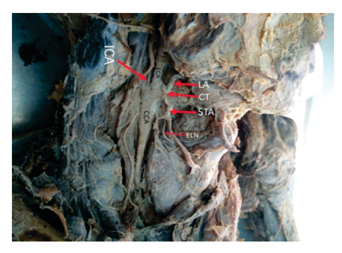
Figure 2 . Showing the origin of STA by common trunk with lingual artery at right CCAB (0 mm from the CCAB) and external laryngeal nerve is posterior at the origin of STA and turning medially away from STA at 0.5 mm above the apex of thyroid lobe

Figure 1 . Showing the origin of STA from right CCA 0.2 mm below the CCAB and external laryngeal nerve is posterior at the origin of STA and turning medially away from STA at 10 mm above the apex of thyroid lobe