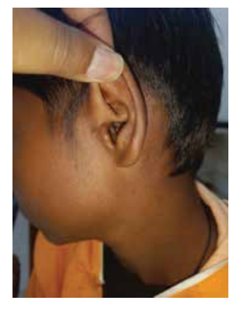
Figure 3. Postoperatively Dry Ear