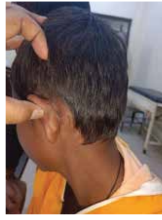
Figure 4. Postauricular healed scar