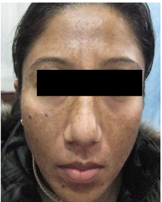
Figure 3. Photograph of a patient of group A before the treatment.

The demographical variables, type and distribution of melasma is shown in table 1. Patients rating for good to excellent outcome accounted 82.3% and 40.8% among group A and group B patients respectively. (Fig. 1,2).