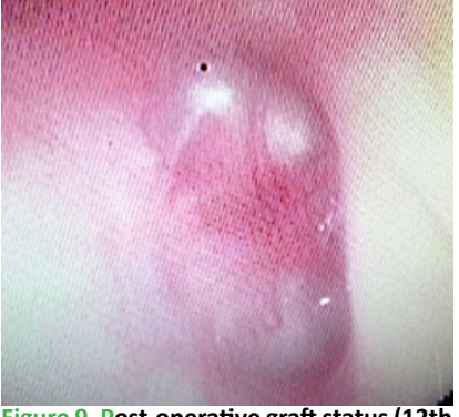
Figure 8. Post-operative graft status (6th Figure 9. Post-operative graft status (12th week).