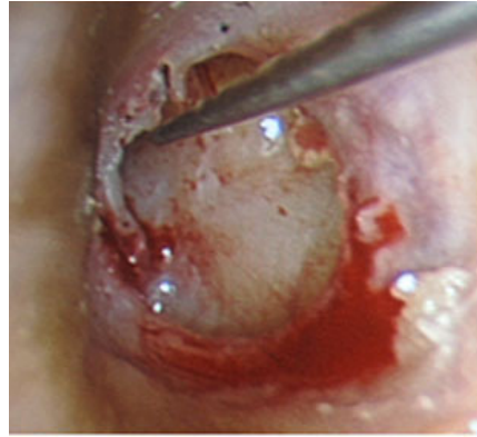
Figure 5. Refreshing of the tympanic membrane perforation margin.