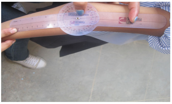
Figure 4. Measurement of Carrying Angle by Using Goniometer.